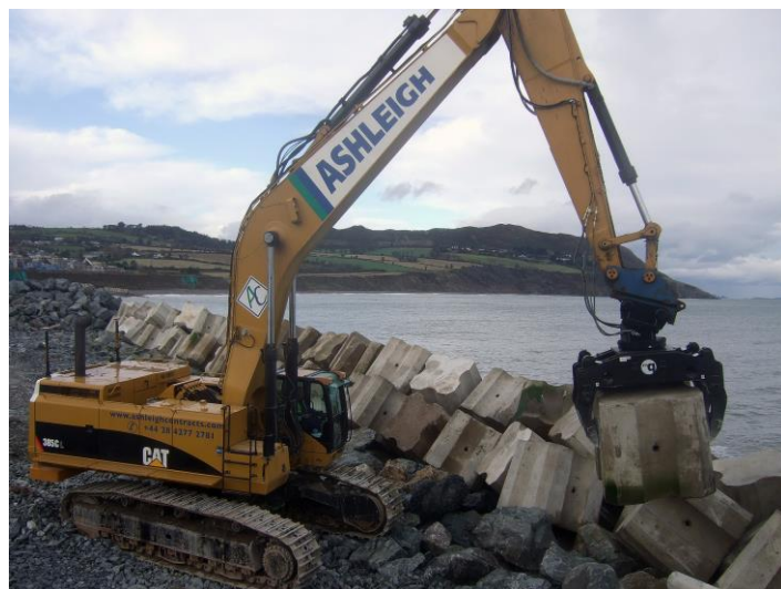
Views of revetment preparation of seaward face of the Breakwater Quay Walls and placement of 14T Antifer Units