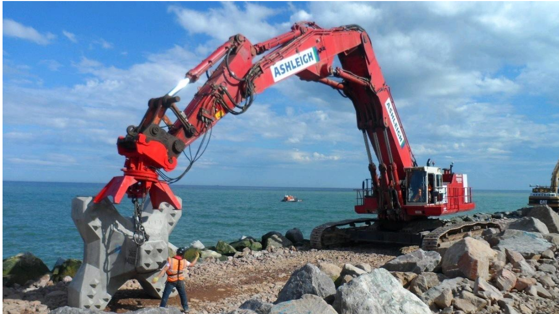
Ashleigh's Hitachi EX1200XXL (220T Excavator) preparing to lift and place a 20T Accropode Unit