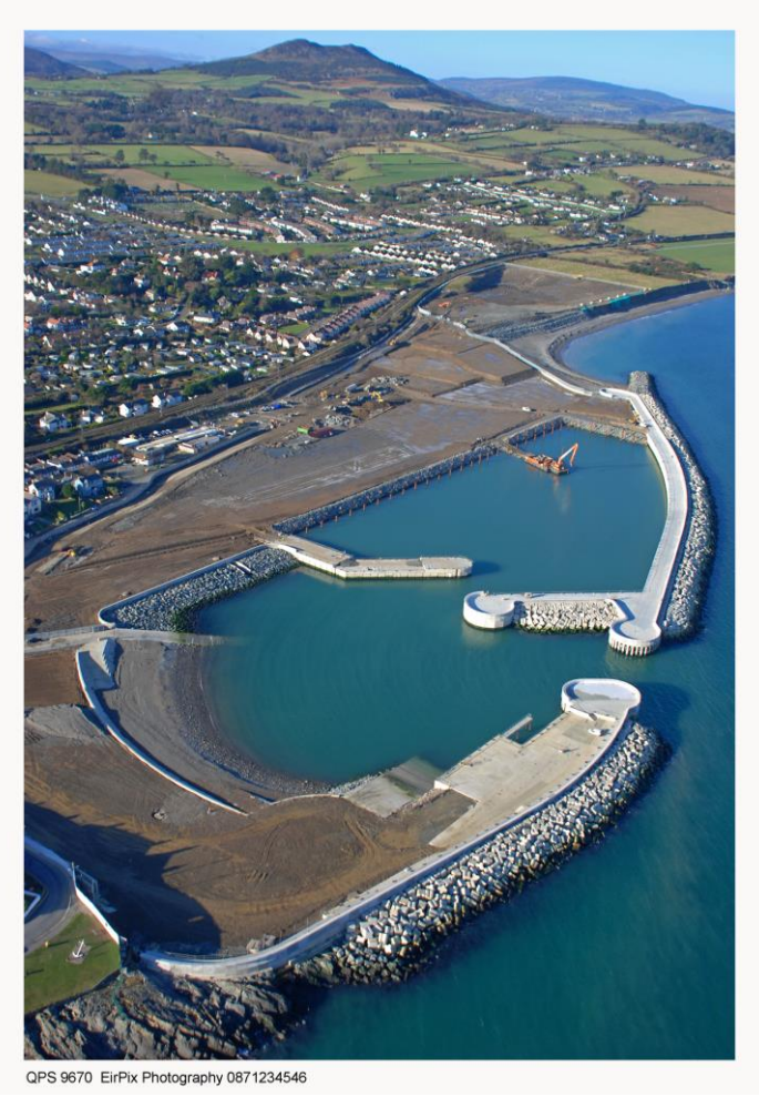
Aerial Views of the Harbour Development – Ashleigh Contracts undertook all the coastal protection works protecting the new Quay Walls, Revetments and Foreshore including the formation of the Reclamation areas for future development.

ASHLEIGH CONTRACTS 30c Ballygelagh Road, Kircubbin, Newtownards, Co. Down BT22 1AE Tel: 028 4277 2781 Fax: 028 4277 2685 Email: info@ashleighcontracts.com www.ashleighcontracts.com