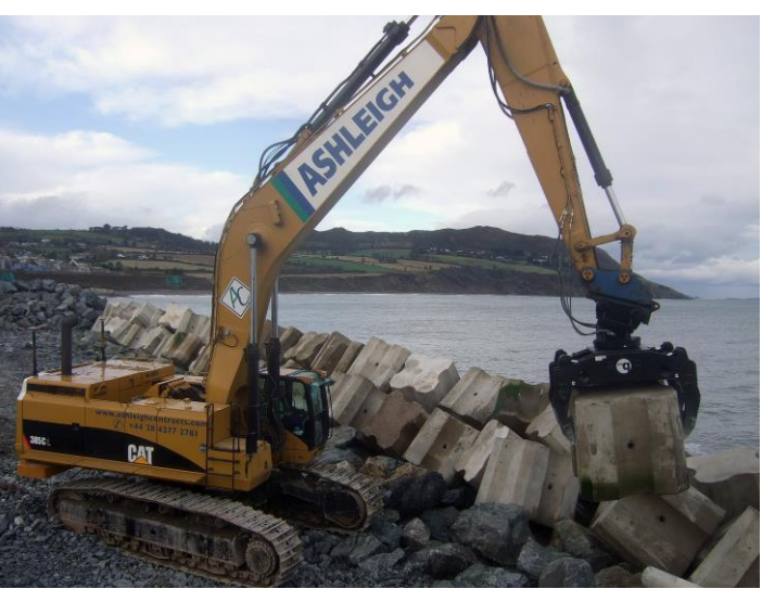
Views of revetment preparation of seaward face of the Breakwater Quay Walls and placement of 14T Antifer Units