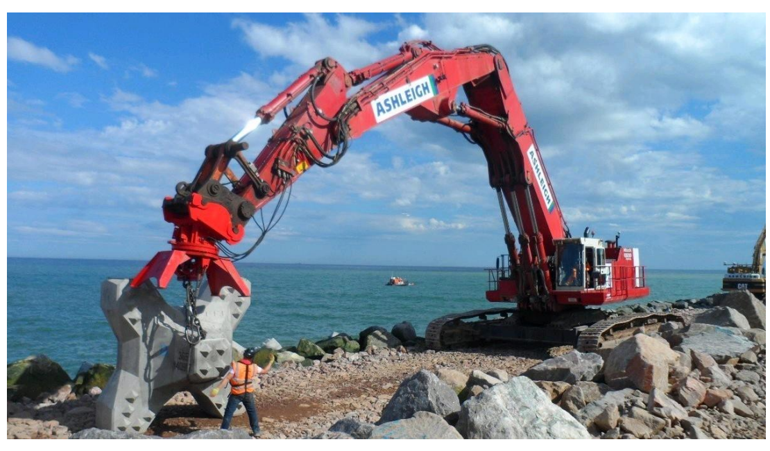
Ashleigh's Hitachi EX1200XXL (220T Excavator) preparing to lift and place a 20T Accropode Unit